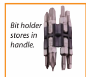
Bit holder stores in handle.