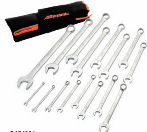
D074221 16 Piece SAE Satin Finish Combination Wrench Set - Contractor Series