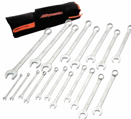
D074223 19 Piece Metric Satin Finish Combination Wrench Set - Contractor Series