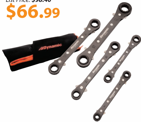
5 Piece Double Box End Reversible Ratcheting Wrench Set (25° Offset)